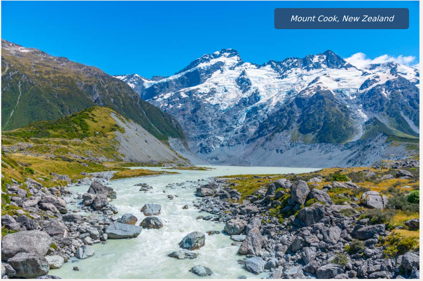
Mount Cook, New Zealand