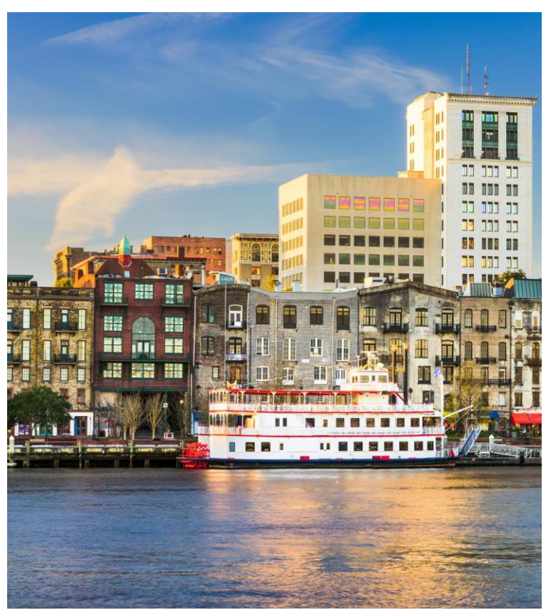
7 Days • 9 Meals: 6 Breakfasts, 3 Dinners

HIGHLIGHTS... Historic Charleston, Choice on Tour: Walking Tour or Fort Sumter Cruise in Charleston, Boone Hall Plantation & Gardens, Savannah, St. Simons Island, Jekyll Island, Golden Isles Cruise