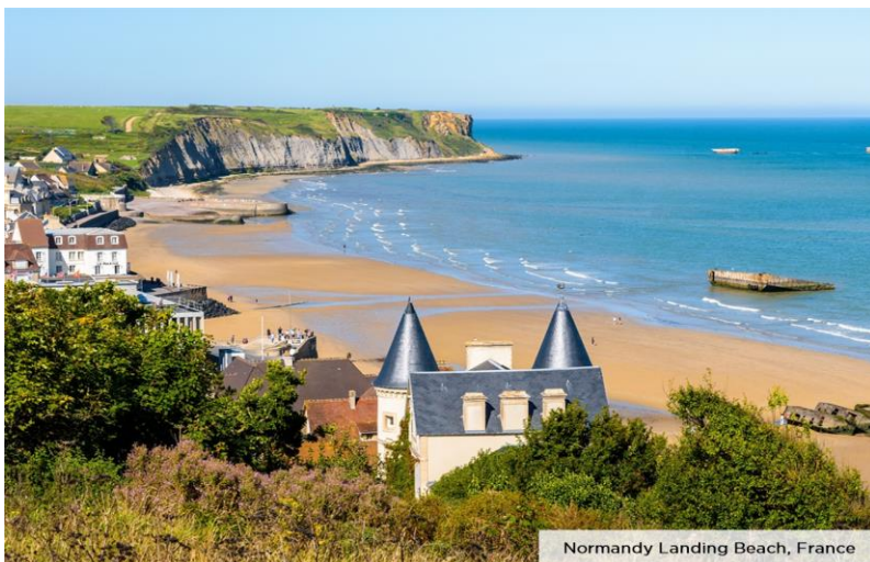
Normandy Landing Beach, France