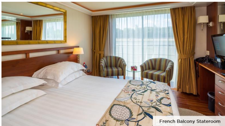
French Balcony Stateroom

7-night cruise | June 6-13, 2026 | Aboard AmaDante