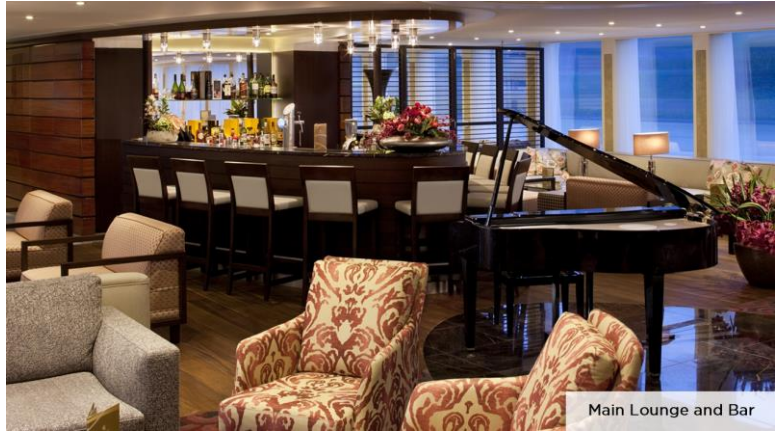
Main Lounge and Bar