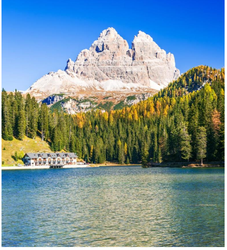
9 Days • 12 Meals: 7 Breakfasts, 1 Lunch, 4 Dinners

HIGHLIGHTS... Treviso, Tiramisu-Making Demonstration, Verona, Choice on Tour: Verona Painted City or Verona and its Waters Walking Tours, Murano Glass-Blowing Demonstration, Venice, Asolo, Prosecco Winery Tour, The Dolomites, Bassano del Grappa, Venetian Villa Visit