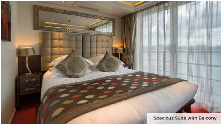
Spacious Suite with Balcony

7-night cruise | November 8-15, 2022 | Aboard AmaPrima