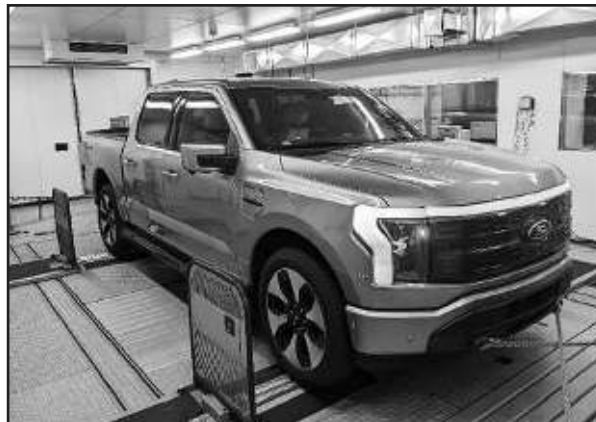
Electric pickup drivers beware: AAA testing reveals that heavy cargo can cut your range by 25%.

gross vehicle weight rating (GVWR), which is the maximum weight of the vehicle, including everything attached, inside the cab, inside the bed, etc. The vehicle AAA tested was the Platinum trim, which has a GVWR of 8,550 lbs. The total weight for the loaded test was 8,440 lbs, 110 lbs shy of the GVWR.