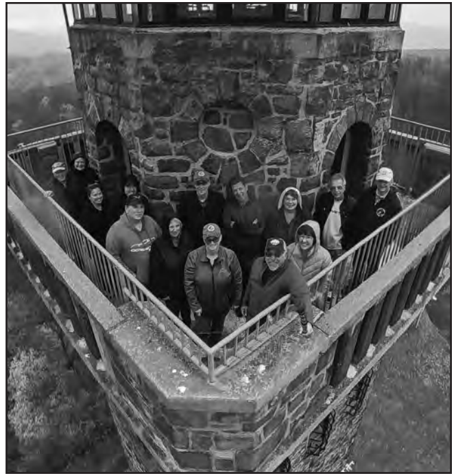
Skyline Drive Corvette Club members at the William Penn Memorial Tower.

Food, prepared by the Oley Fire Company, and drinks