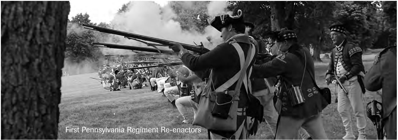
First Pennsylvania Regiment Re-enactors