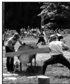
Check out the 72nd Woodsmen Show August 2, 3 and 4, 2024 at Cherry Springs State Park, Galeton, PA. Ax throw, two-man cross cut, two-man log roll, horse pulls, more!

The Bayless Pulp and Paper Mill was Austin’s largest industry and major employer. While those who lived in the area were no doubt thankful for the opportunity to earn a wage in a remote area, history shows that some folks questioned the dam’s stability. That misgiving soon became reality.