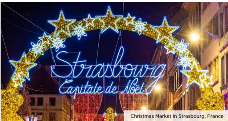
Christmas Market in Strasbourg, France

Optional Land Program Pre-cruise 2 Nights Zurich & 2 Nights Lucerne from $1,680 pp