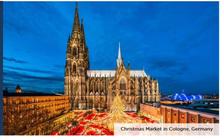
Christmas Market in Cologne, Germany

7-night cruise from Basel to Amsterdam November 30-December 7, 2023 | AmaSiena