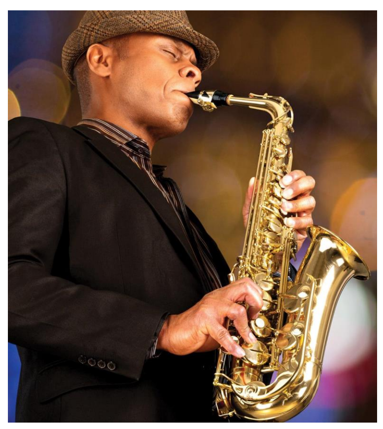
8 Days ● 10 Meals: 7 Breakfasts, 3 Dinners

HIGHLIGHTS... French Quarter, Choices on Tour, Swamp Tour, Mardi Gras World, Jazz Revue, Graceland, West Delta Heritage Center, Ryman Auditorium, Grand Ole Opry Show, Country Music Hall of Fame, Historic RCA Studio B, Hands-on Chocolate-making Lesson