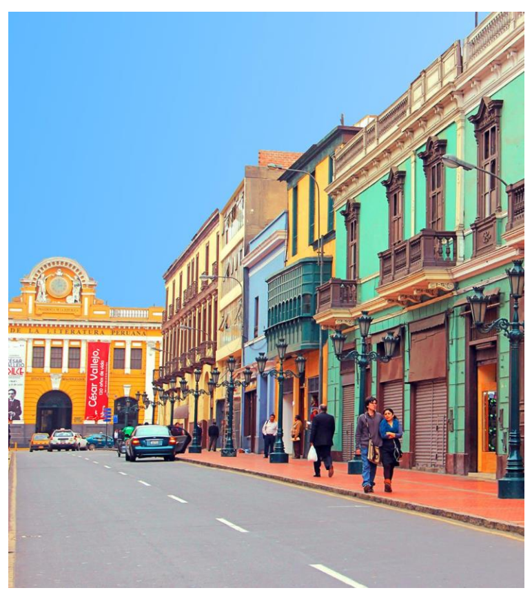
10 Days • 15 Meals: 9 Breakfasts, 2 Lunches, 4 Dinners

HIGHLIGHTS... Lima, Sacred Valley of the Incas, Local Andean Cultures, Ollantaytambo Ruins, Home-Hosted Lunches, Machu Picchu, Cuzco, Choice on Tour, Lake Titicaca, Uros Floating Islands