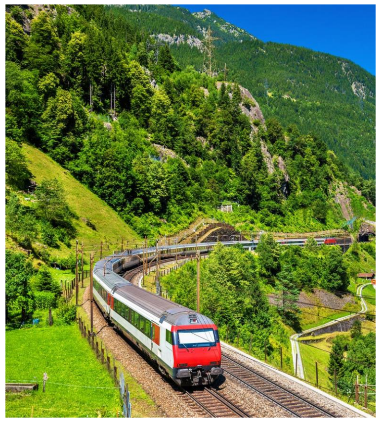
9 Days • 13 Meals: 7 Breakfasts, 1 Lunch, 5 Dinners

HIGHLIGHTS... Oberammergau Passion Play, Wies Church, Neuschwanstein Castle, Black Forest, Château de Chillon, Zermatt, Matterhorn Museum, Grimsel Pass, Lucerne